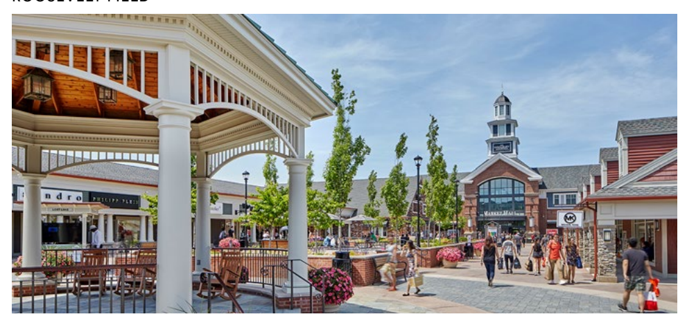
WOODBURY COMMON PREMIUM OUTLETS®